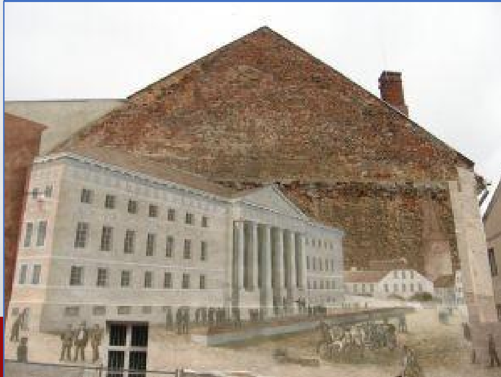
Tartu Von Bock House