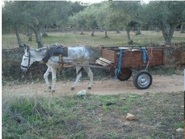
Donkey cart rides